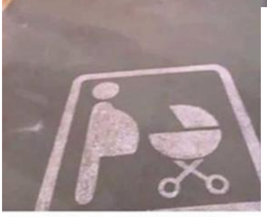
I went to the grocery store and they now have a parking spot for Fat guys that like to grill. That's so considerate.